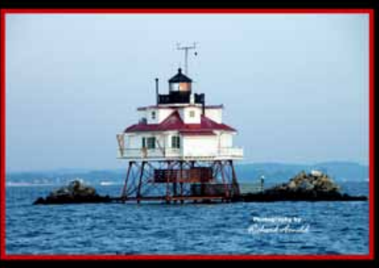
Thomas Point Shoal Lighthouse.