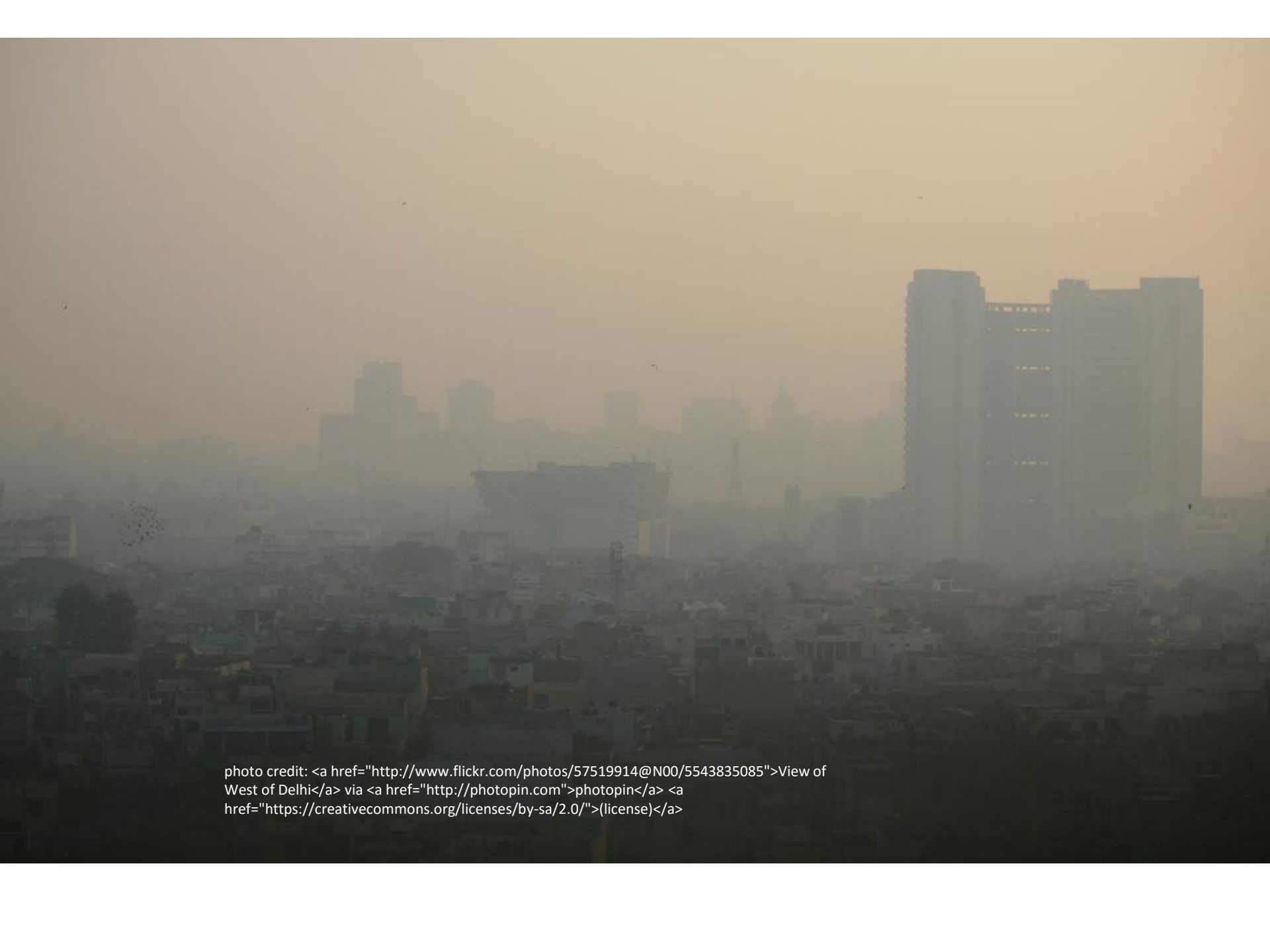
>View of West of Delhi</a> https://creativecommons.org/licenses/by-sa/2.0/ >(license)</a>